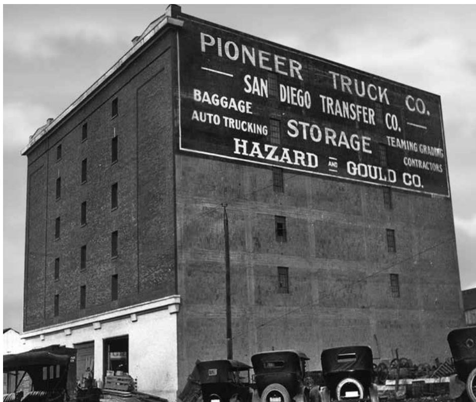
Hazard and Gould Company performed grading and leveling while Pioneer Truck Company supplied 100 laborers, 150 mules, and 10 motor trucks.