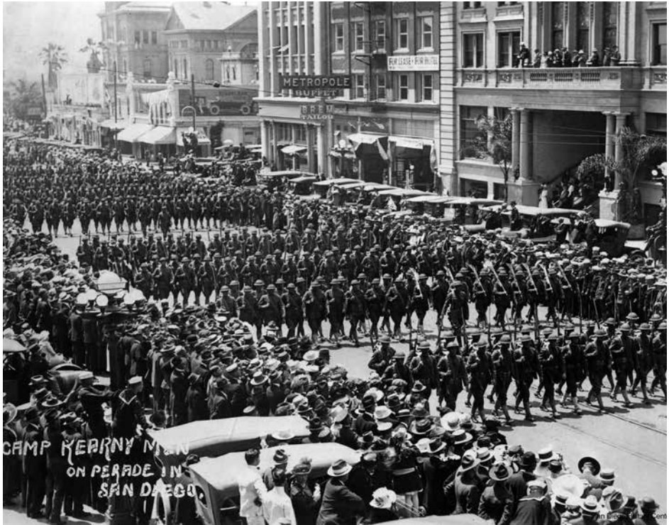
Camp Kearny Parade, 2nd and Broadway, 1917 ©SDHC 81:9444.

precipitated a massive walkout. The leaders of San Diego's individual labor unions met with Hampton and Lieutenant Rogers to hash out the situation and, when Hampton balked, Rogers simply ordered the contractor to comply with the labor demands. With a fair wage and good conditions, the laborers worked a flexible workweek with some ten-hour days that paid overtime. The men worked on Sundays only if absolutely necessary, and if they chose to do so. Board and lodging cost only $1 per day and included transportation. By the end of September some four thousand workers swarmed over the construction site. 28