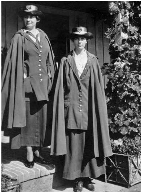
Official staff uniforms, Junior Women's Club Hostess House, Camp Kearny, San Diego.

the trainees, and required the men to wear masks at all times. But by November 1918 both the war and the flu were over. At that point the two most pressing questions on the minds of the Kearny soldiers became, "When can we go to dances and shows and when do we go back to civilian clothes?" 43