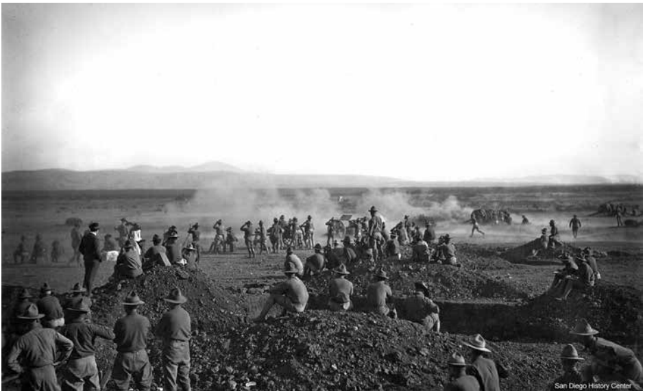
Dust at Camp Kearny, c. 1918.

The installation of the camp sewage system paralleled the water line construction, and both met a major obstacle in the mesa's impenetrable soil. The ground on the mesa consisted of a thin layer of topsoil above a "thick strata of cemented gravel as hard as concrete" which locals called "caliche." Even with the concerted efforts of 1,200 laborers, the hardpan brought the trenching progress almost to a halt. Here, the Army engineers resorted to a proven standby—explosives. Workers placed six sticks of dynamite in holes spaced about fourteen inches apart. After the blast, which threw debris fifty feet high, shovel men stepped in and removed the loosened material. Because of the danger, the supervisors halted all work within one thousand feet of the trench blasting. Contractors applied the same excavation system to create the trenches and foxholes. 32