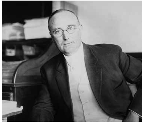
Congressman William Kettner, 1915.

Recognizing the economic impact of a military base in San Diego, the Chamber of Commerce, within a year after World War I began in Europe, campaigned for a camp. In late 1915, officials considered what they would need to offer the national government to pull off the scheme. The Chamber of Commerce queried California Senator John D. Works—a San Diego resident and a member of the Senate’s Committee on Expenditure of the War Department—about the anticipated increase in the size of the armed forces and the need for new camps. About the same time, San Diego’s opportunistic congressman William Kettner took time from his courtship of the Navy to prepare a bill for funding the establishment of an Army base in San Diego. 5