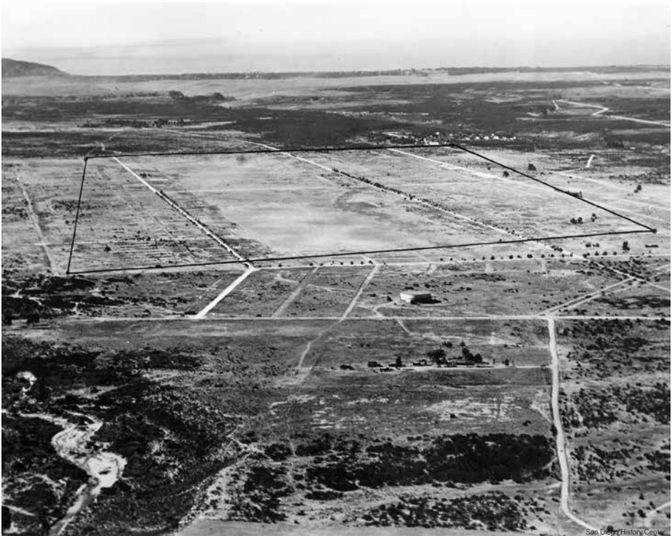
Camp Kearny, c. 1918.