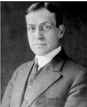
Secretary of War Newton D. Baker.

A concerted national mobilization effort would provide the men, but the government still lacked the facilities to train a projected million-man army. The