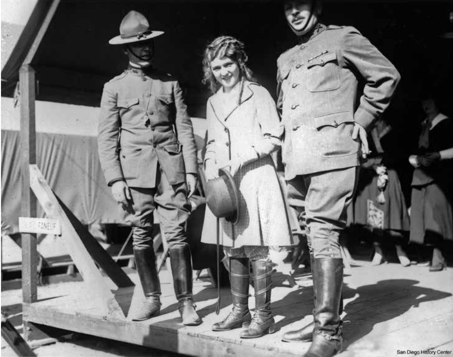
Mary Pickford entertains the troops at Camp Kearny, 1918.

indignity of riding wooden barrel horses rather than the real thing. Unwanted spectators became another unexpected problem. Controlling the crowds that trooped out to the construction site to observe and comment on the biggest show in town developed into a serious nuisance. Every day, hundreds of sightseers swarmed over the camp, interfering with workers, clogging the roads, and slowing the movement of the trucks transporting building materials. While the Army and the contractors begged the sightseers to stay away and let the men do their work, the San Diego Sun blithely urged everyone to trek out to the construction site because it had to be seen to be believed. Despite the best efforts of the Army and contractors, the construction sideshow took on a life of its own and continued unabated for weeks. 37