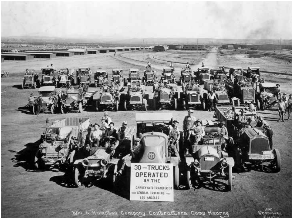
Building Camp Kearny, c. 1917.

and National Guardsmen, and completely train the new volunteers and draftees. Wilson tasked the War Department to do this with a training system one military historian called “uncertain and underdeveloped” at best. 2 In the end, it fell to Secretary of War Newton D. Baker—an avowed pacifist—to resolve the dilemma. 3