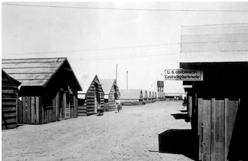
Camp Kearny, 1918.