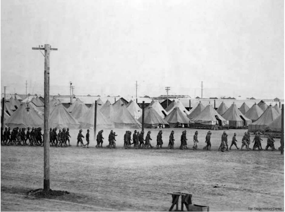
Camp Kearny tents, c. 1918. ©SDHC 81:9646.