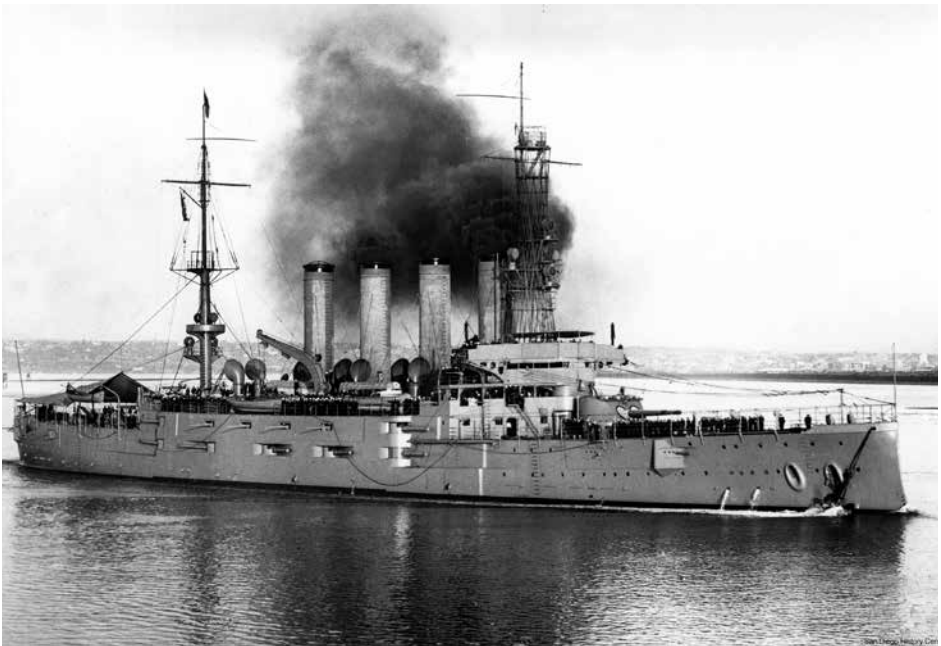
USS San Diego in San Diego Harbor prior to World War I. It was sunk by a mine in 1918.