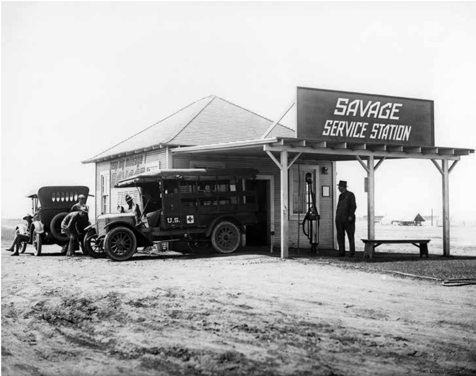
Savage Service Station, Camp Kearny c. 1917.

Dry soil created an unintended problem: dust. Major Nichols recorded that the movement of men, machines, and horses churned up immense clouds of dust that caused extreme difficulties for the laborers and often brought work to a standstill. 33