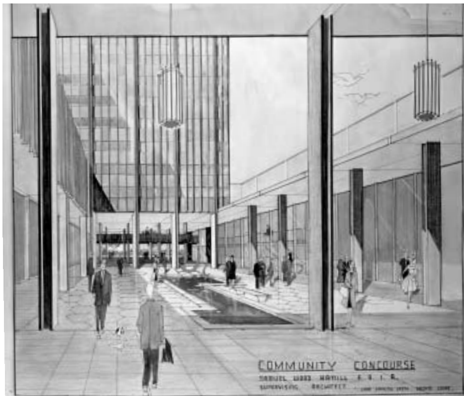
San Diego Community Concourse, Samuel Wood Hamill, Presentation Drawing, 1962. SDHS 13609

pencil on tracing paper, 11 initial rough sketches, 3 positive photostats, 2 signs, 3 bluelines, 6 photographic reproductions. February 9, 1967 – January 23, 1968.