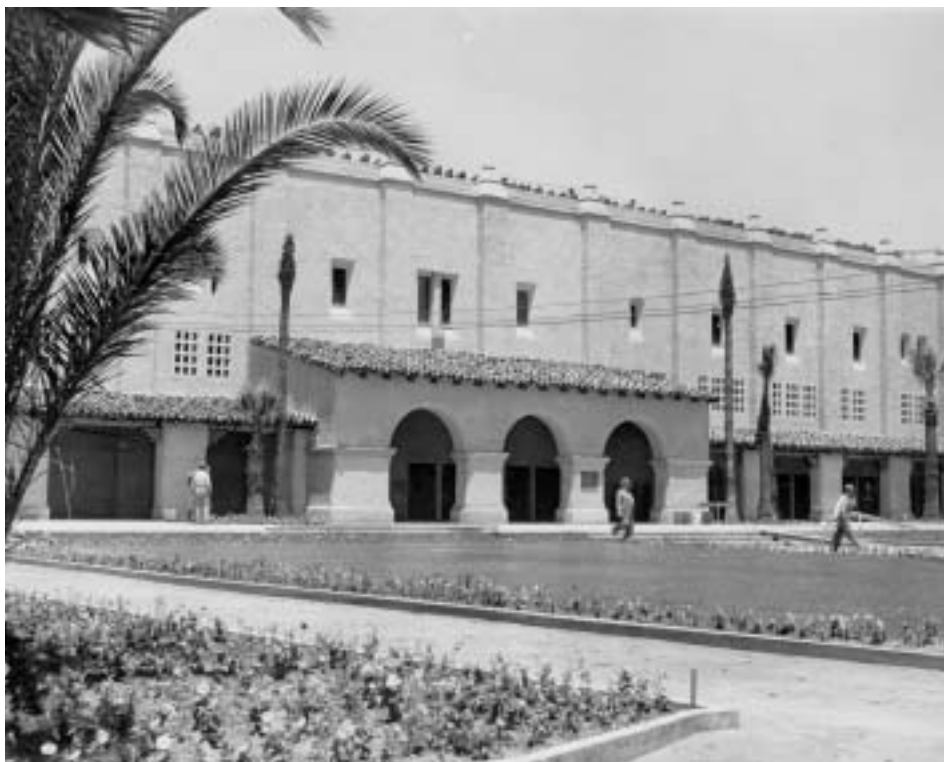
Del Mar Fairgrounds and Race Track, Jackson and Hamill (1936-1938), 1938.