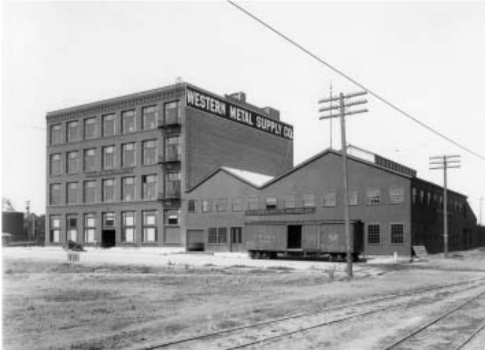
Western Metal Building, Henry Lord Gay, ca. 1920. SDHS 146