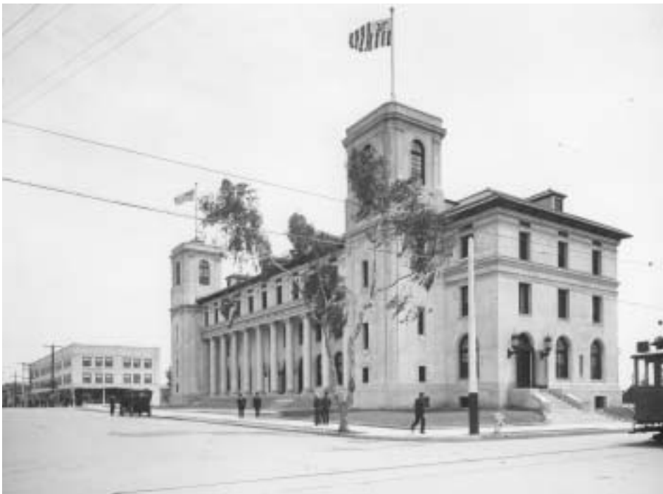
U.S. Post Office and Customs House, James Knox Taylor (1911), 1916. SDHS 4155