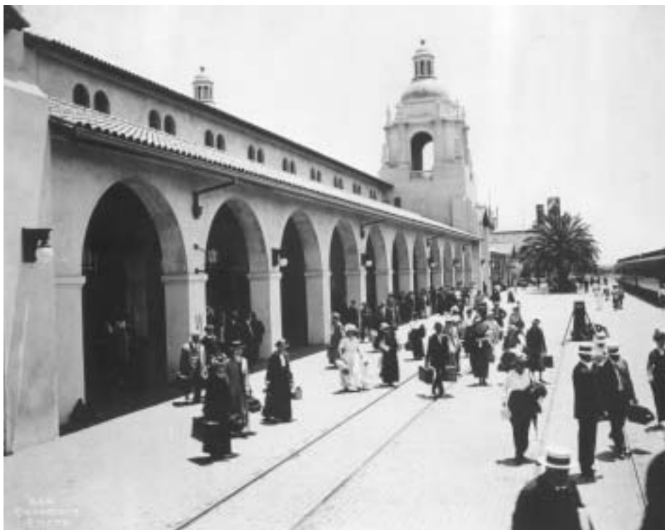
Santa Fe Depot, Bakewell and Brown, 1915.