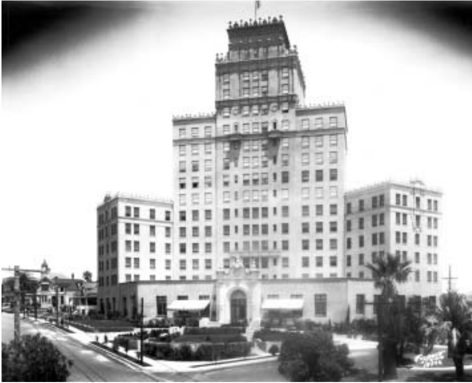
El Cortez Hotel, Walker and Eisen, 1926. SDHS 7061