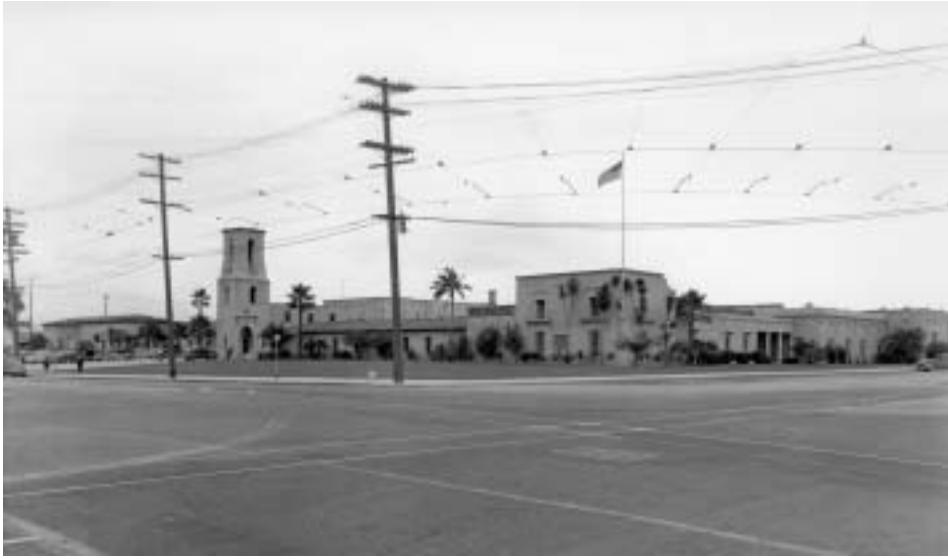
Police Station, Quayle Brothers and Treganza, 1940.

San Diego Tuberculosis Hospital, additions, 6 blueprints, March 17, 1924.