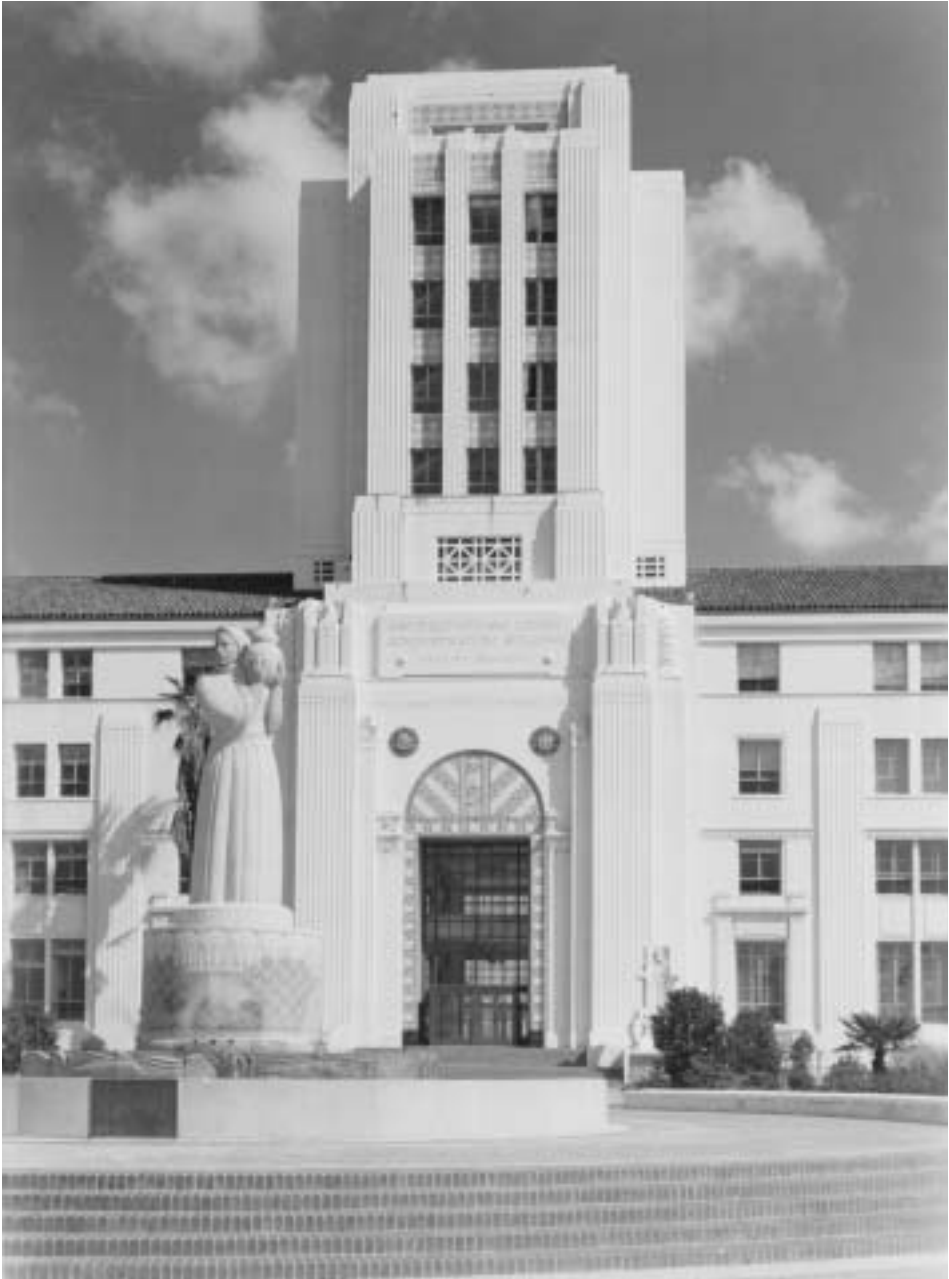
San Diego Civic Center (County Administration Center), Gill, Johnson, Requa and Hamill (1938), 1940.