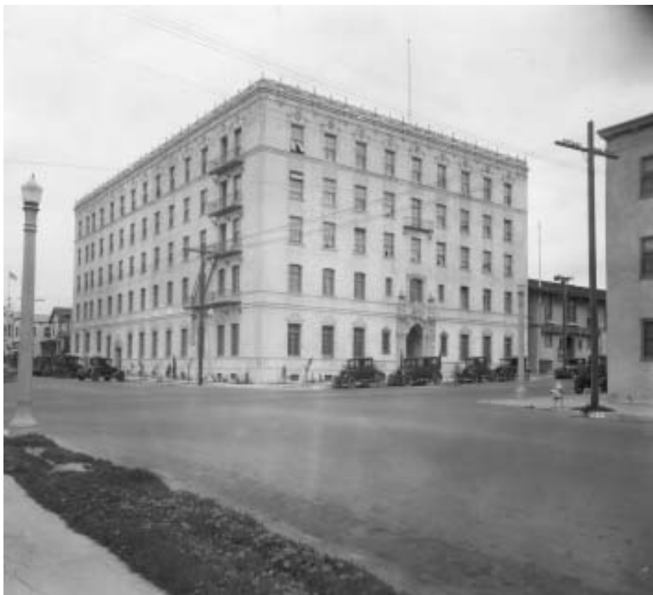
YWCA, Decker and Stevenson (1926), 1927.