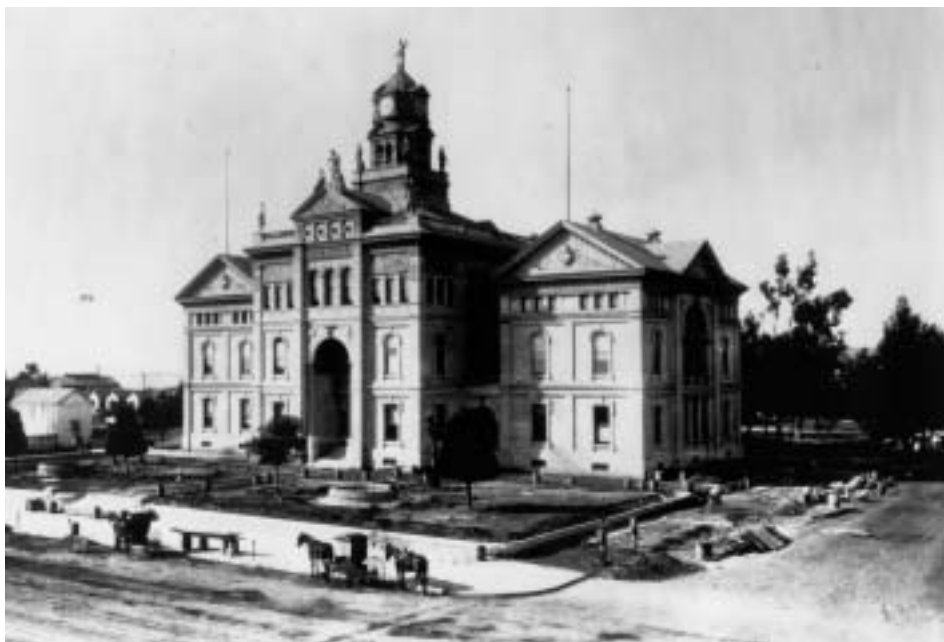
San Diego County Court House, Comstock and Trotsche, 1890. 79 SDHS 632