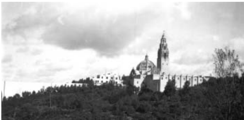
California Quadrangle, Bertram Goodhue, 1915. SDHS 2912-116