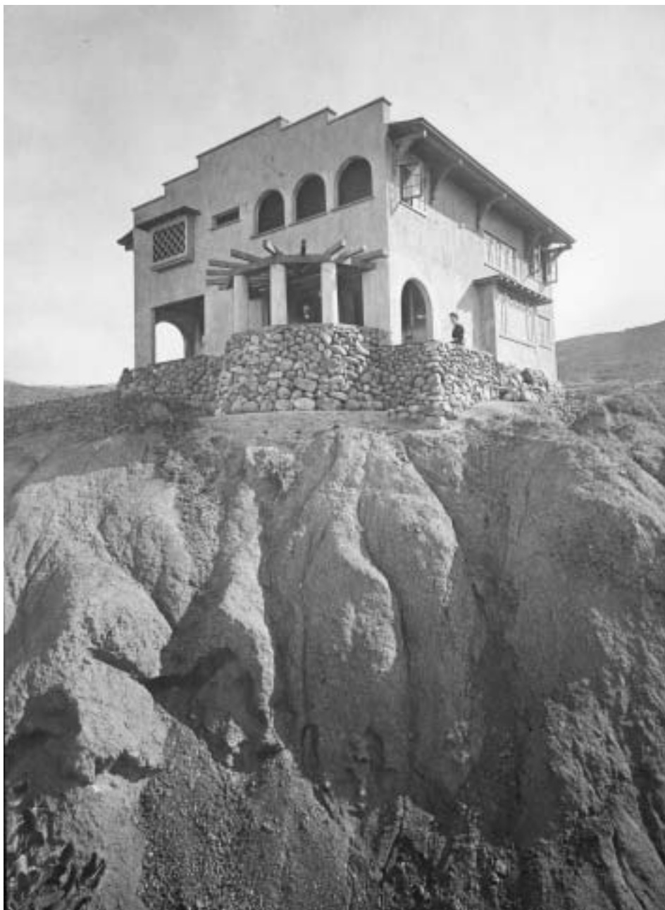
Wheeler Bailey House, Irving Gill and Frank Mead, 1915.