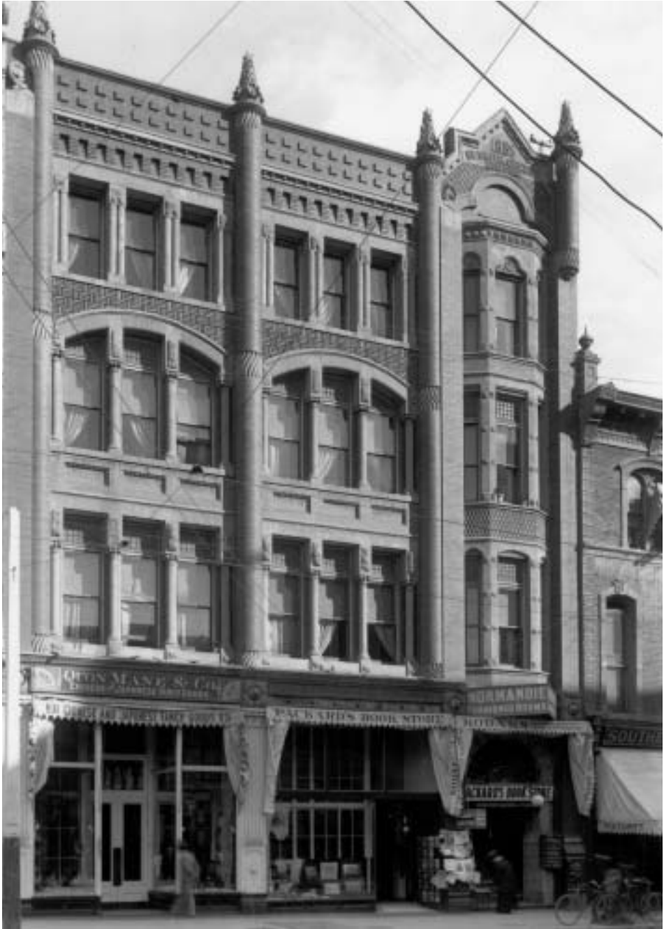
Nesmith Greely Building, Comstock and Trotsche (1888), 1906. SDHS 558