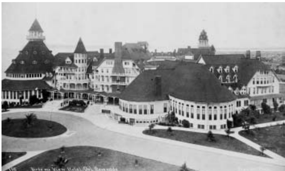
Hotel Del Coronado, Reid Brothers (1888), 1895. SDHS 80-12757