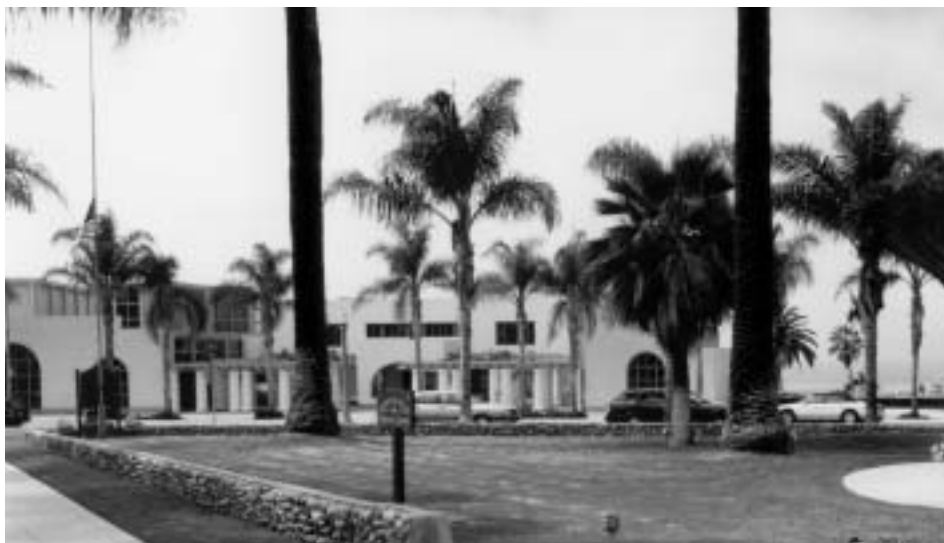
La Jolla Museum of Contemporary Art, (Irving Gill) Mosher Drew and Watson (1975-80), 2001. SDHS 2000-100.217