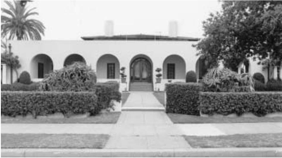
La Jolla Women's Club, Irving Gill (1912), 1977.

Linda Vista Housing Development, site A, B, and C additions, 4 blueprints, May 8, 1942.