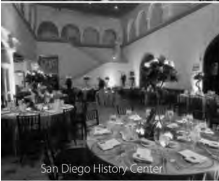
San Diego History Center