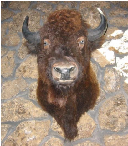
2 Photo by Joe Goldberg, cropped, https://creativecommons.org/licenses/by-sa/2.0/