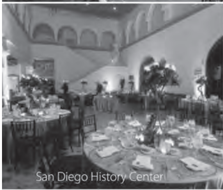
San Diego History Center