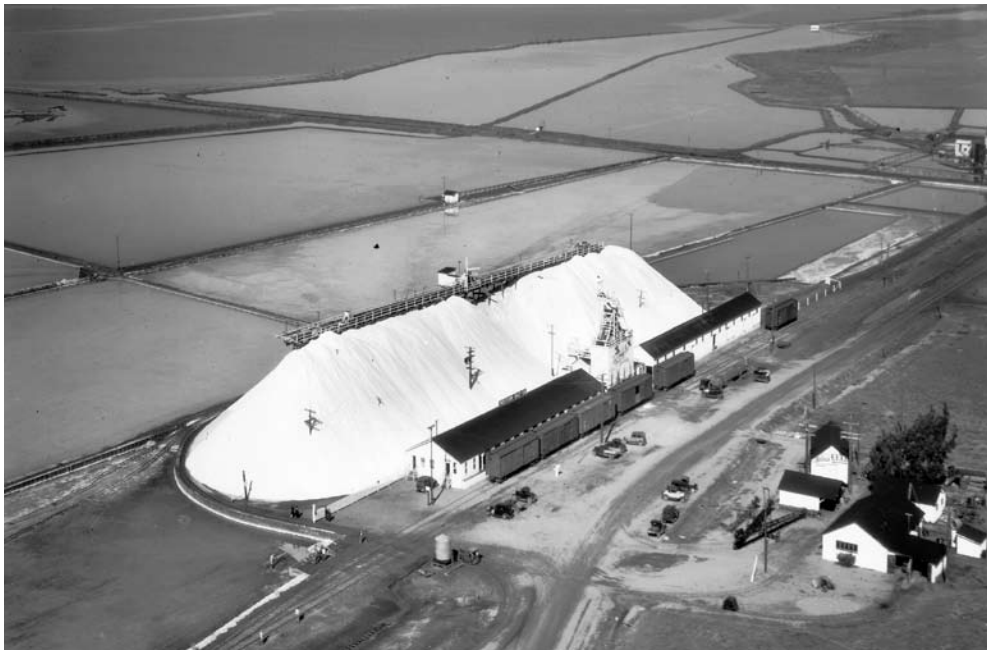
Stockpiles of salt and evaporation ponds of the Western Salt Works operation at the extreme southern end of San Diego Bay in 1934. The gleaming white mountains of salt were a familiar Chula Vista landmark.