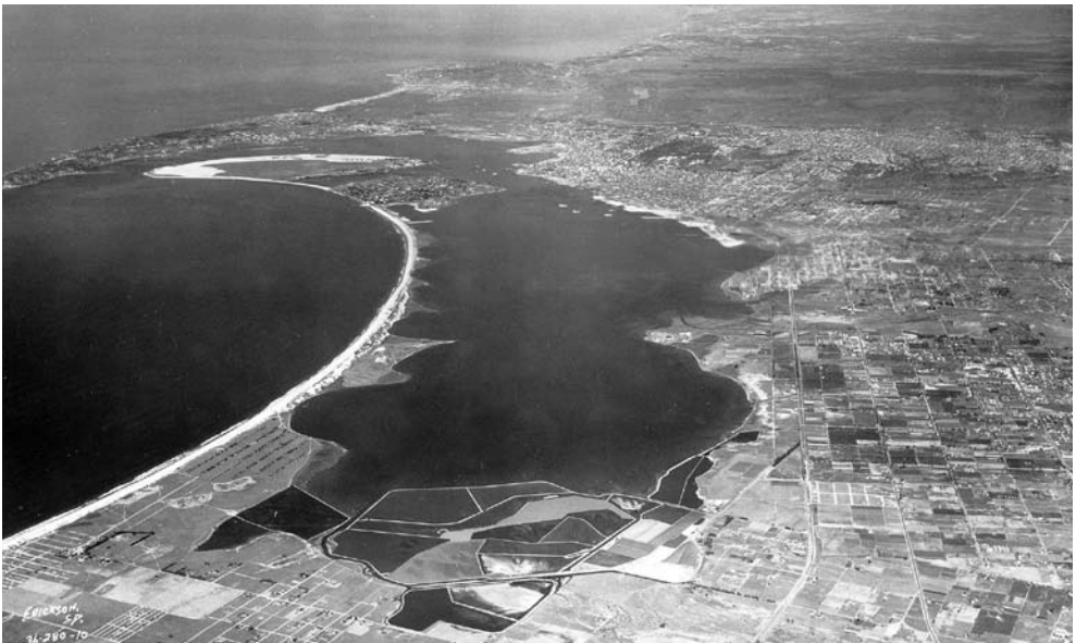
The entire San Diego Bay is shown in this 1936 photograph taken over Otay Mesa. The curve of the Strand portion of the Coronado peninsula on the left ends at the large flat area of North Island Naval Air Station. White areas are sand and rock that have been dredged from the bay to enlarge the base. Dark areas that appear to be fenced in the bottom part of this image are evaporation ponds for producing salt from sea water.