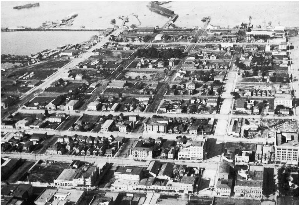
Coal bunkers operated by the Spreckels Company were a landmark on the bay from the time of their construction in 1888 until the late 1920s when they were torn down. Seen at top center of this 1911 image, the S-shaped wooden wharf with its tall black bunkers held 15,000 tons of coal. 8