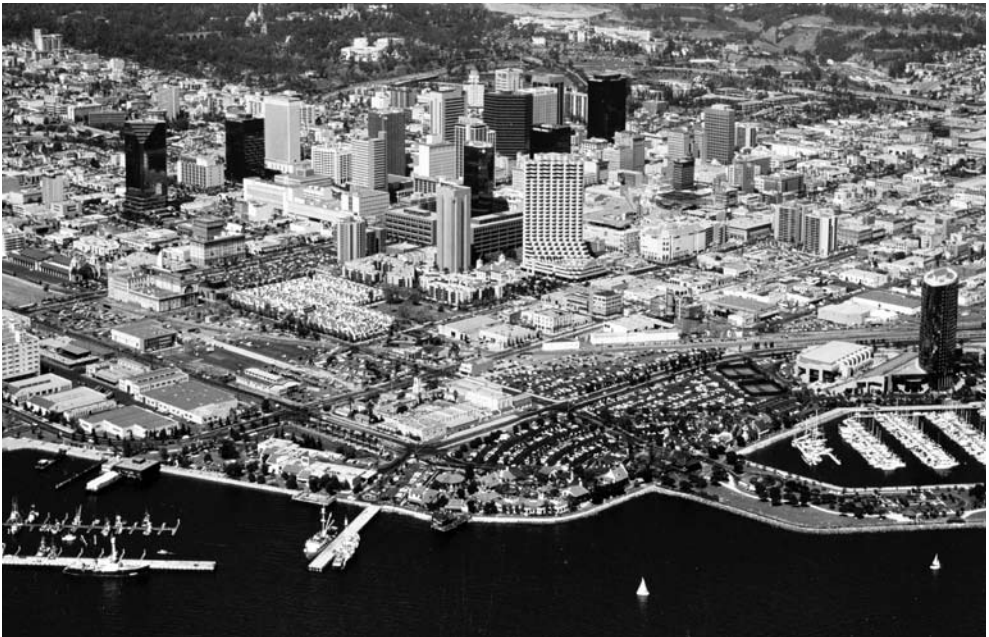
This 1985 view of the downtown area of San Diego completes this one-hundred-year photographic survey of changes around San Diego Bay. In this single image, many of the present land uses around the Bay are represented: (from left) Navy Region Southwest buildings; fishing boats moored at the docks; Seaport Village representing tourism and retail uses; and Embarcadero Park and a pleasure boat marina for recreation. For all its changes, San Diego Bay remains the premier natural resource of our region.