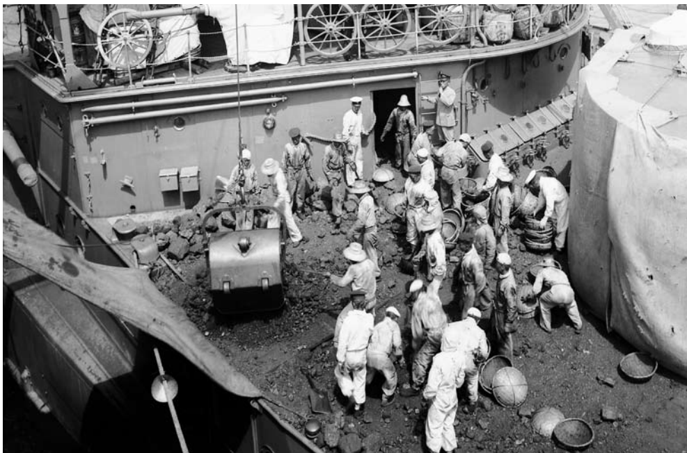
Japanese sailors load coal into the coal bunkers of a cruiser, ca. 1908.