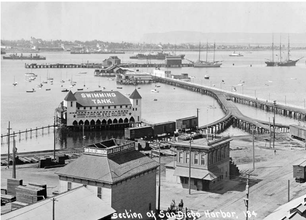
View of the piers and wharves of the San Diego waterfront, looking northwest towards Point Loma. ©SDHS #90:17839.