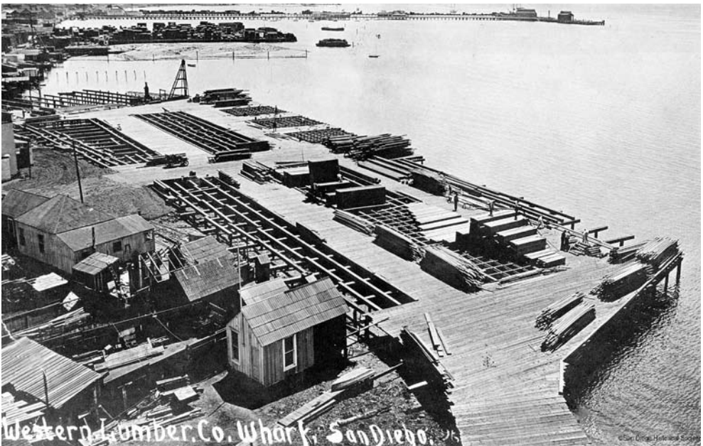
Lumberyards around San Diego Bay included Russ, Benson, Frost and Western Lumber Company. In this 1910 image, Western Lumber Company had increased its storage capacity by building out over the bay. In the distance, the long wharf is where the Pacific Coast Steam Ship Company brought passengers to San Diego beginning in the 1850s.