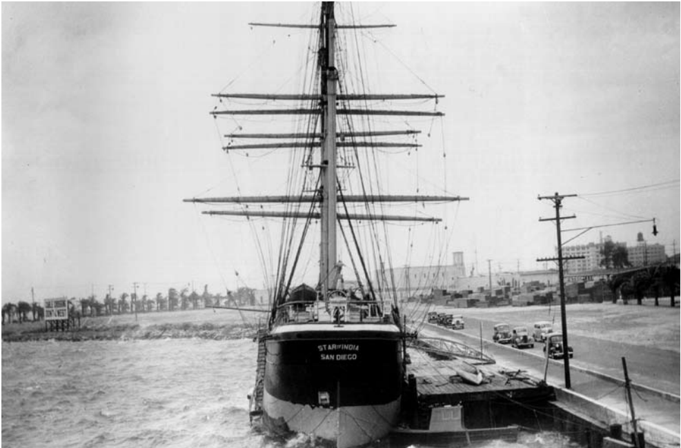
In June 1941, the Star of India, an iron-hulled sailing ship built in 1863, was a derelict moored near the site of today's Marriott Hotel. The ship had been brought to San Diego by the Zoological Society of San Diego as a possible site for a floating aquarium in 1927 but not refurbished until years later. In 1976, she was put to sea for the first time in fifty years to honor the U. S. Bicentennial. 10 #P-1261.