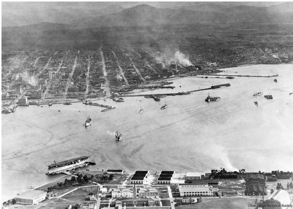
The dredging of San Diego harbor in order to create Harbor Drive is shown in this photo, ca. December 1913