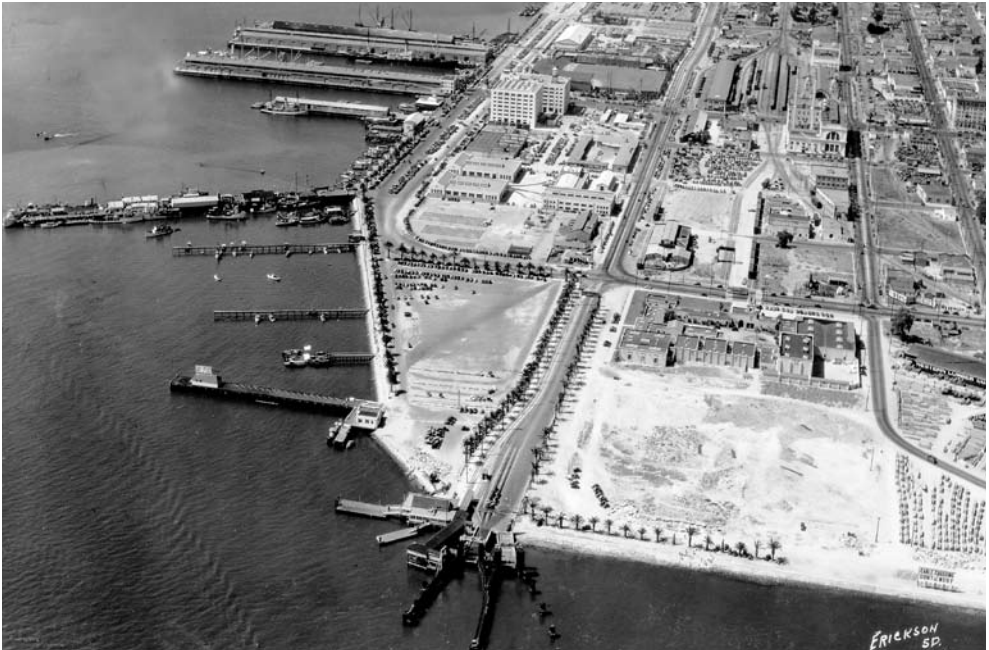
The police station had been completed in this 1940 view looking north. The declining number of piers and docks suggests that the commercial center of San Diego, by this time, had moved north, toward the foot of Broadway. Much of the Embarcadero had been completed, but fishing boats were still moored north of the City-County Administration Building. ©SDHS #79:741-573.