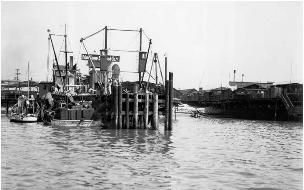
San Diego's rich supply of fish created an industry in which immigrants from many countries worked as laborers on the boats and in the canneries. In 1936, boats unloaded at the Van Camp Seafood dock. Perched over the mudflat to the right is the pier known as "fish camp," basic housing that Van Camp provided to Japanese fishing families.