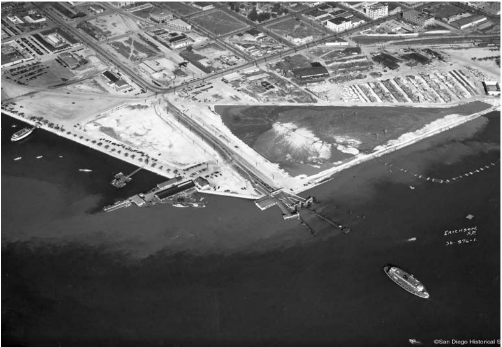
A 1936 dredging operation created the site for a new police station that would be constructed on Harbor Drive. In the 1980s, the remaining land became Seaport Village. In this 1936 photograph, lumber company wharves are almost gone. Fish brokers and markets occupy a small pier to the left of the ferry terminal. ©SDHS #79:741-145.