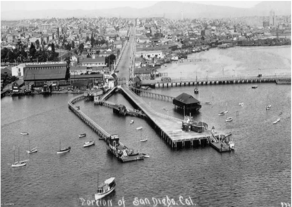
Transportation across the bay to Coronado and Point Loma was solved by a system of ferries. Here, in 1910, a small ferry has left the West Santa Fe Wharf at the foot of Market Street. Also visible at the left are the coal bunkers of the Spreckels Company.