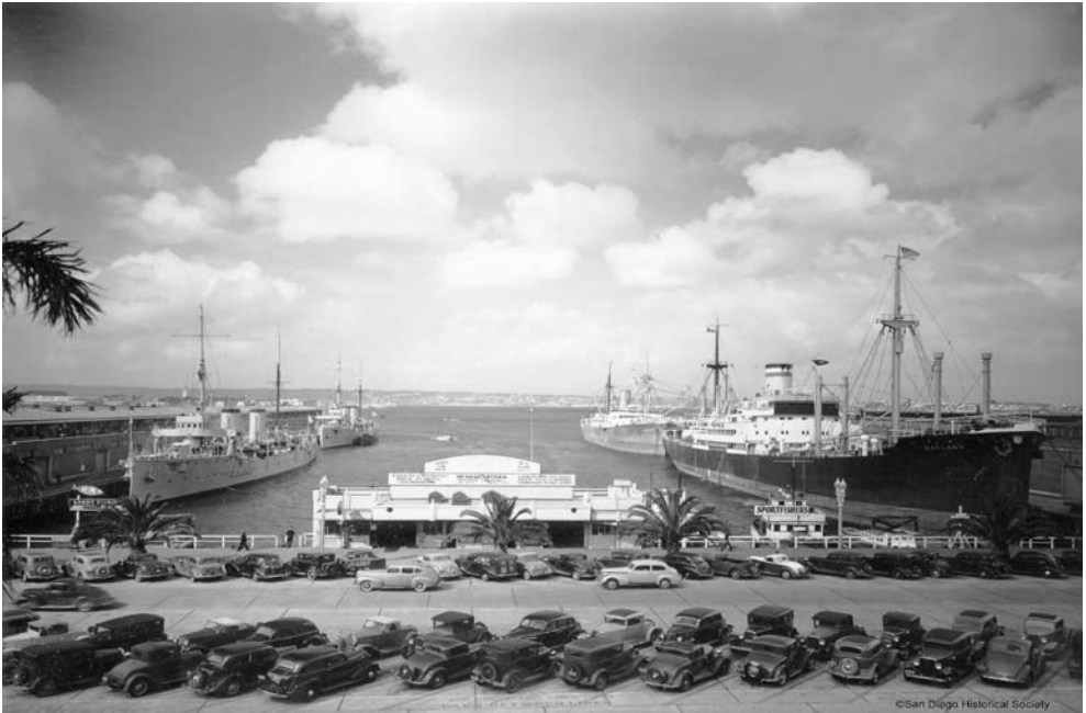
Several freighters tied to two piers in San Diego harbor, ca. 1935. San Diego Water Taxi is between the rows of ships. The ship Oakland is on the right.