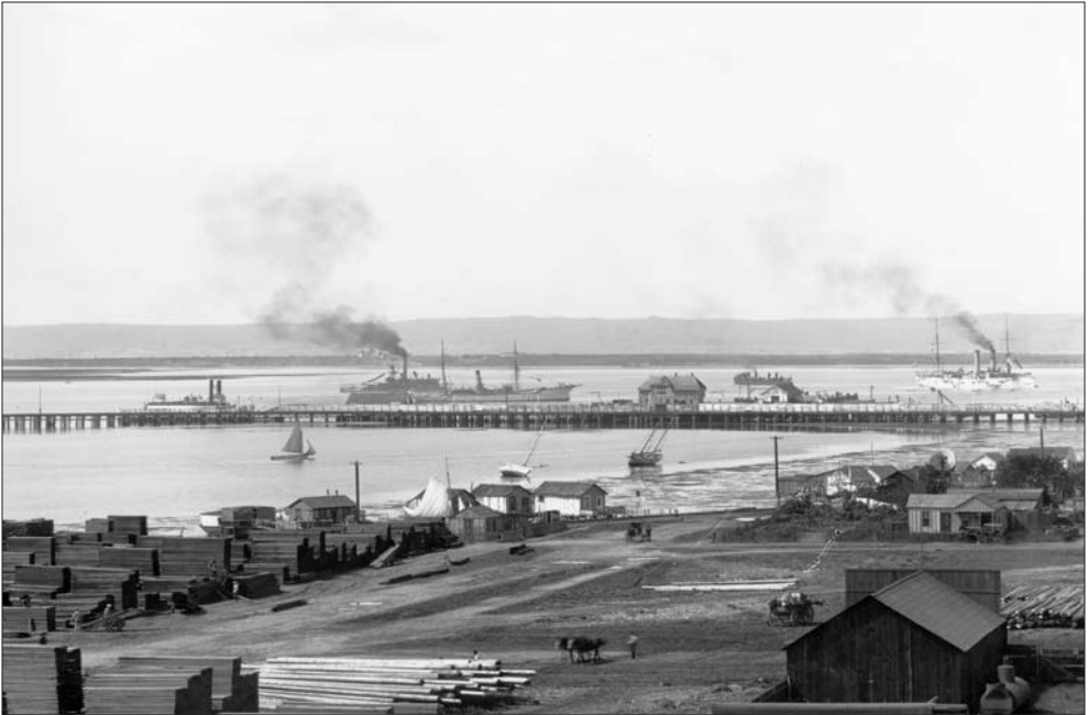
By 1905, lumberyards were a common sight along the bay as the demand for building materials increased for new housing. Beyond Western Lumber Company, seen here, the open land was a tidal flat where boats settled on their keels, awaiting the incoming tide.