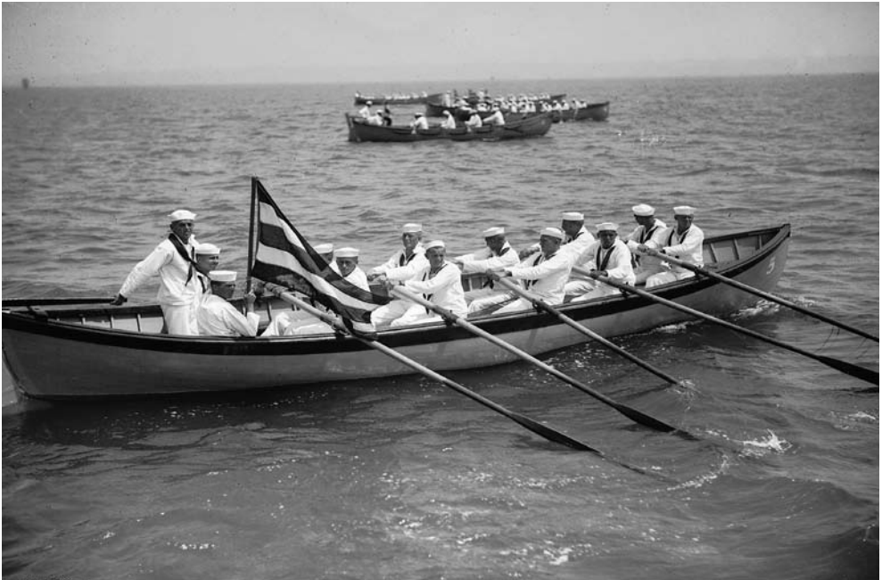
Sailors engaged in a race against four other "pulling" boats during World War I, ca. 1918. Large ships often had competitive rowing teams as part of their athletic program. The sailors' neckerchiefs indicate that they are wearing dress whites so this event may have taken place on a Sunday. ©SDHS 4382-7.