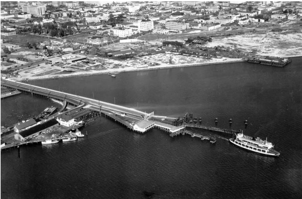
Ferry transportation became more important by 1925 and evolved from passenger-only service to a series of car ferries. After the East Santa Fe Wharf was removed in the mid-1920s, a new ferry dock was built. Car parks for the ferry were adjacent to the ferry terminal. 7