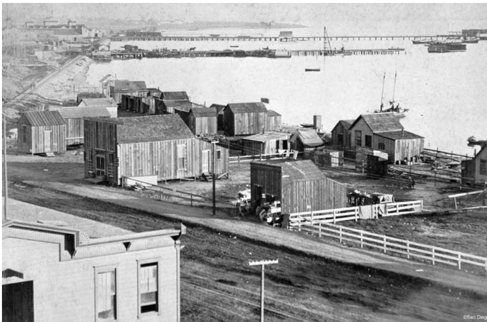
In 1887, mudflats along the water's edge were home to people working on the wharves or in small businesses supporting the shipping trade. Tracks laid along the bay linked San Diego by train to markets and potential immigrants on the East Coast. ©SDHS #3082.