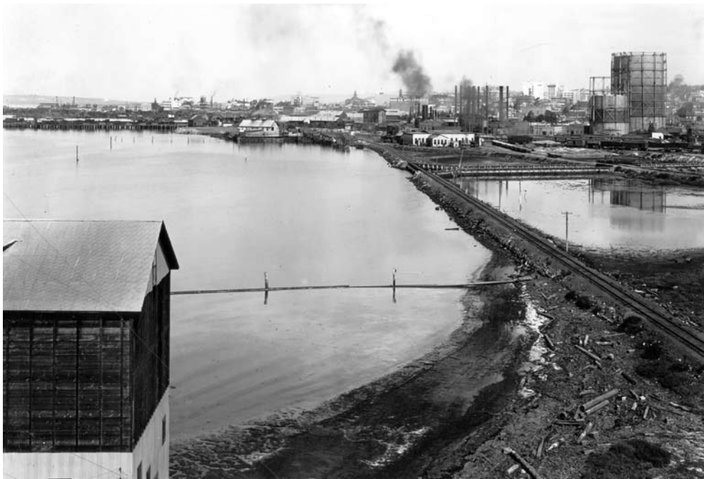
The San Diego Gas Works operation on the bay, with its storage tanks and plume of smoke, was another landmark in 1914. This view shows train tracks running on top of a berm near Tenth Avenue. Harbor improvements eventually eliminated the mudflats in the foreground. #5550.