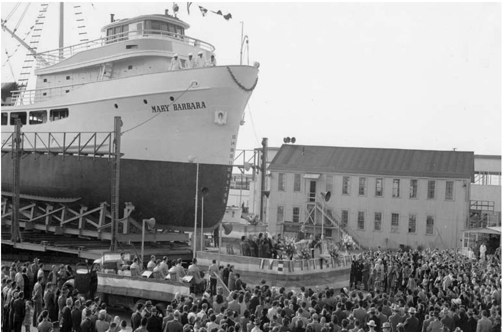
Boatbuilding, both wooden and steel, was another important industry along the bay. Not to be forgotten was San Diego's venture into building reinforced concrete-hulled ships in the 1920s. After World War II ended, requests for newer and bigger fishing boats replaced military orders. In this 1947 photograph, the Mary Barbara is launched at National Iron Works. 9