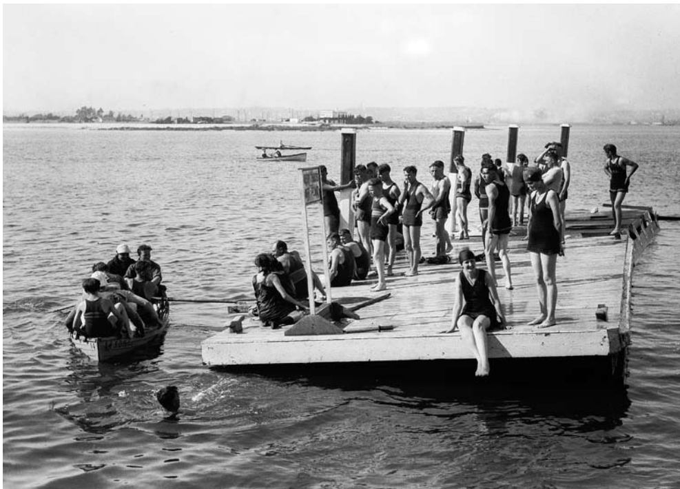
People in bathing suits on a swimming platform in San Diego Bay, 1922.